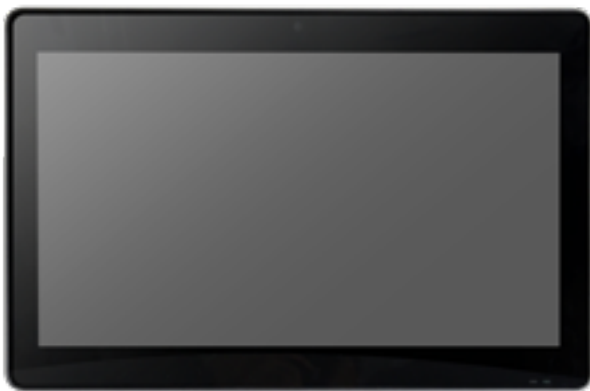
■ Front View